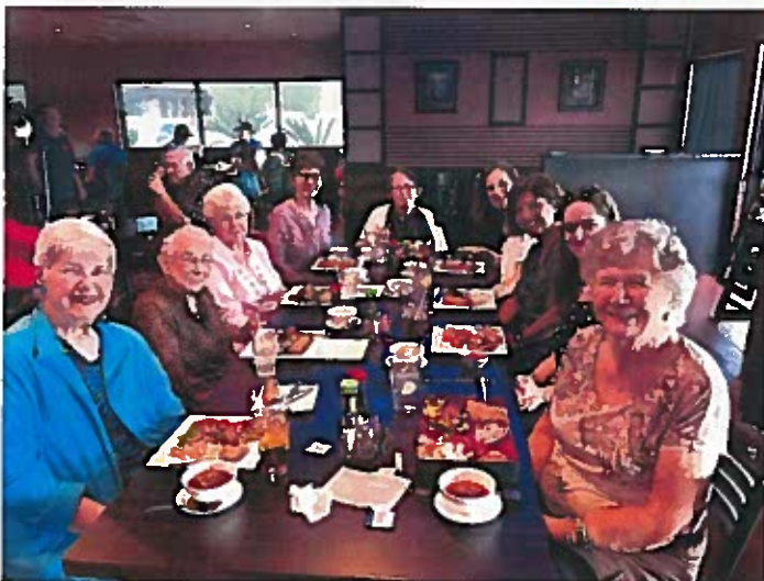
Ladies Lunch Bunch at Blue Fish April. Ladies, if you are free on the third Thursday of each month, join the crowd.