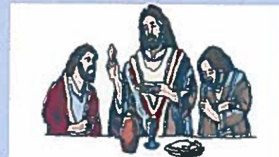
"The Upper Room ..."

Join us Sunday Mornings at 9:30 a.m. New Lenten Study begins on March 5